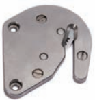
Knife with stainless support